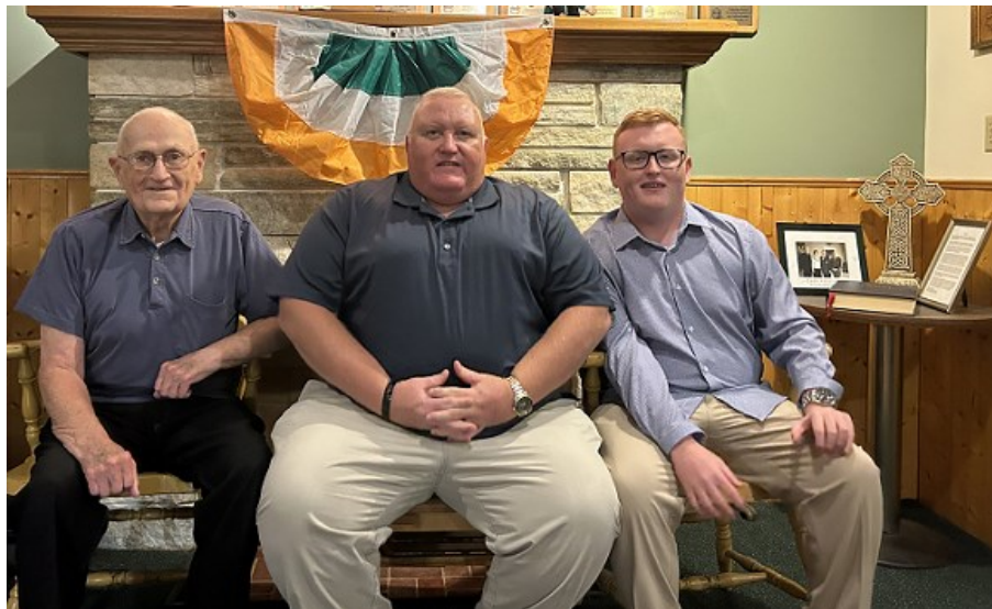
Three Generations of Hibernians